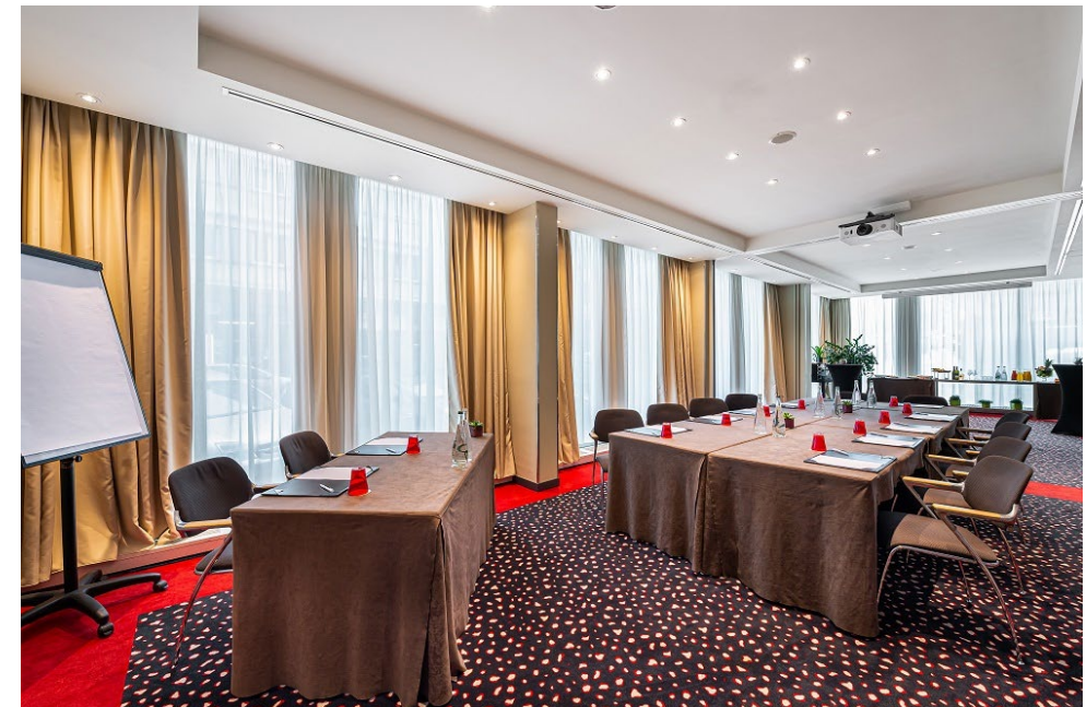
Salon Nolita, 70m 2

Organize your event in an artistic and casual atmosphere. Add a touch of personalized service, state-of-the-art technologies, unparalleled expertise and your project becomes a reality with every success guaranteed.