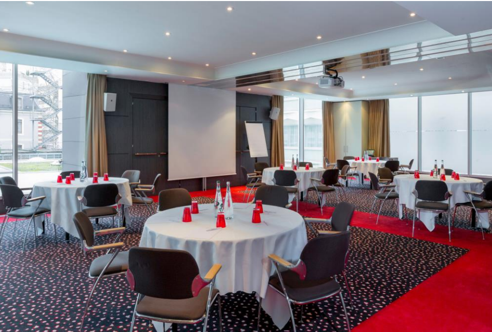
Salon SAUSALITO, 135m 2